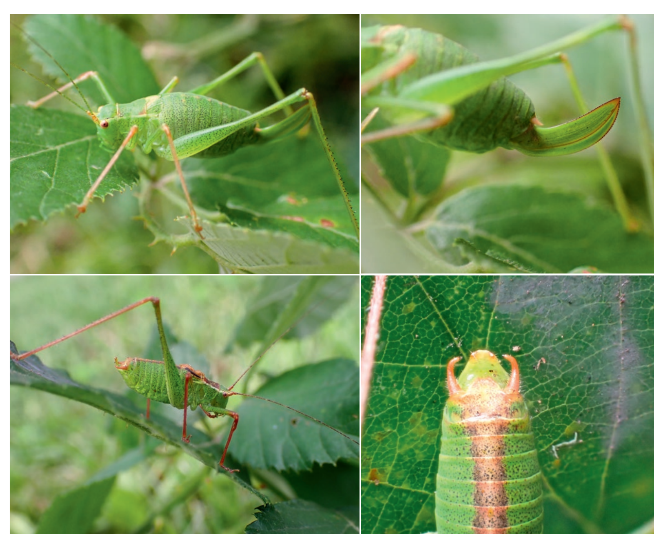
Fig. 1: Leptophyes punctatissima: female (top left), female ovipositor (top right), male (bottom left), and male cerci (bottom right). Pictures from individuals at the site where the population was observed near Neustift/ Novacella.